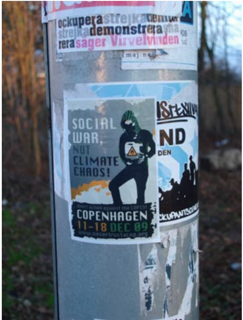
For protest groups an important media technology was stickers in public places all over the Øresund region, as on this lamp-post in Lund.