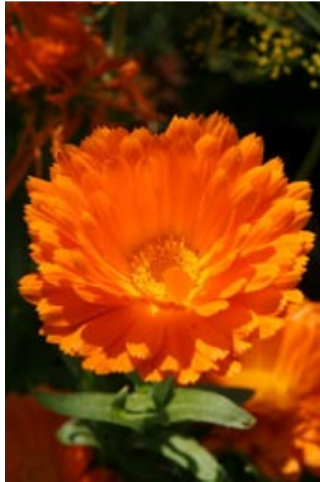
After confessing ones sins, the absolution came in a little white envelope containing Marigold seeds.

As the three boys confessed their sins, they also acted out the ritual. However, their con-