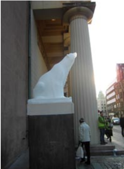
The melting polar bear Trude outside the cathedral in Copenhagen by the artist Olaf Storø. Foto: Olaf Storø.

Danish government: “Green churches are like water melons – green on the outside but red inside” (Hauge 2009). From outside of the church the involvement into environmental concern is